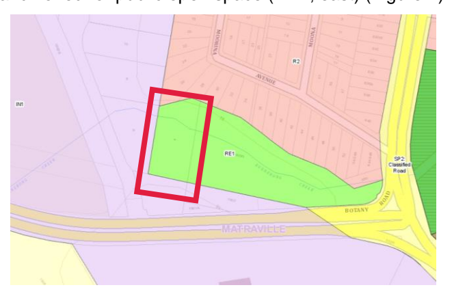
Figure 2. 1903R Botany Road, Matraville.

The site is privately owned however is zoned RE1 Public Recreation and Council has an obligation to acquire the land under the Land Reservation Acquisition Map in the LEP. The exact size of the site is not specified in the proposal but is estimated to be approximately 3,355m²-(as calculated from an aerial map). It comprises a vacant lot surrounded by Port Botany industrial uses (IN1; west and south), low scale residential (R2; north) and land zoned for public open space (RE1; east) (Figure 2).