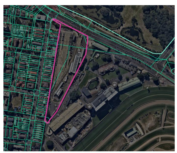
Figure 1. Subject site (approximate) outlined in pink with lot boundaries in green.